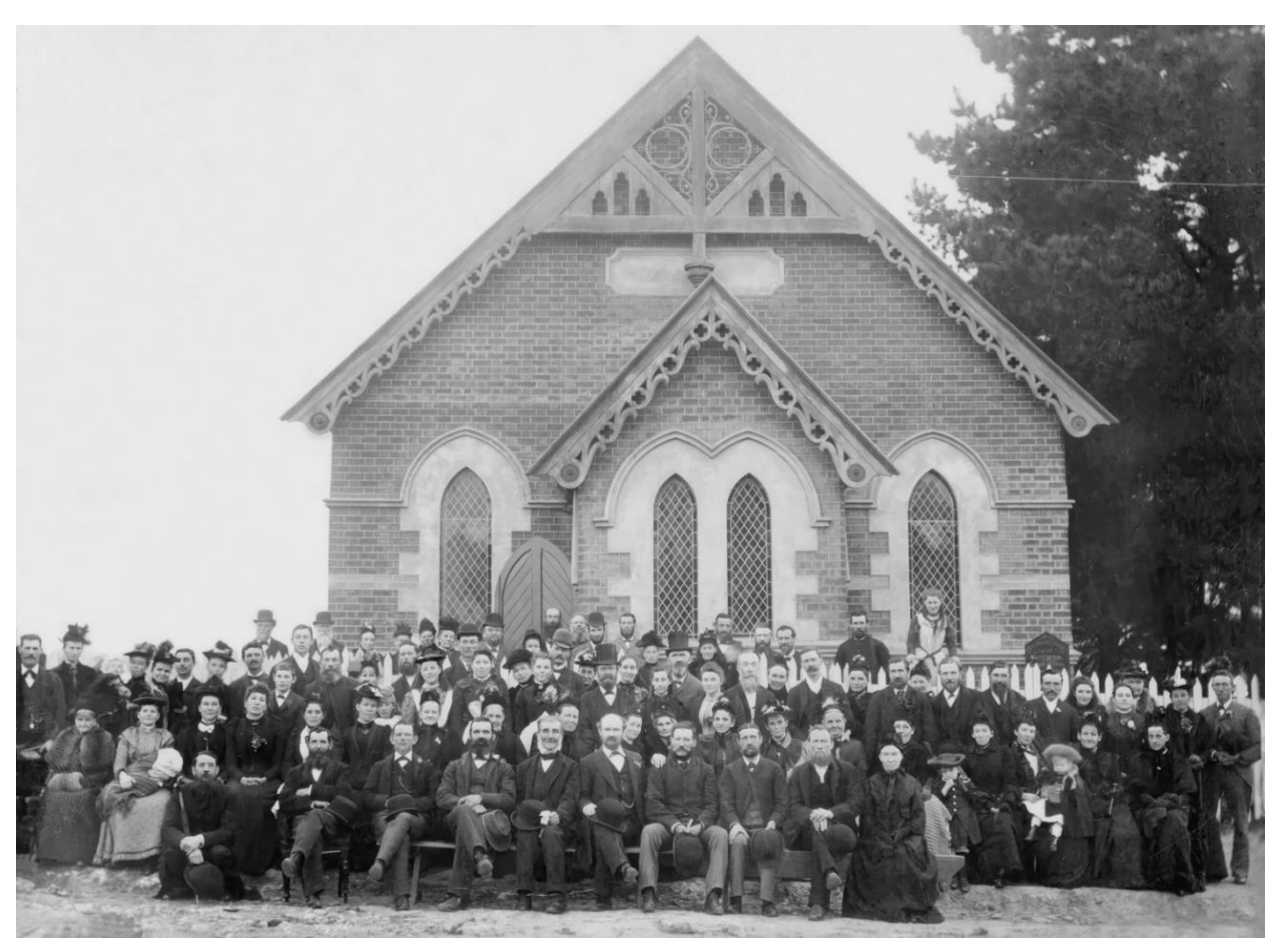
30th Anniversary of the Doncaster Church of Christ - Congregation in 1893